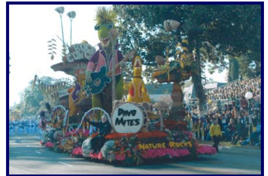
The City of Cerritos 2006 Rose Parade Float "Dino Mites" won the Bob Hope Humor award