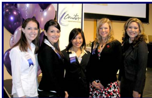
2007 Miss Cerritos Contestants